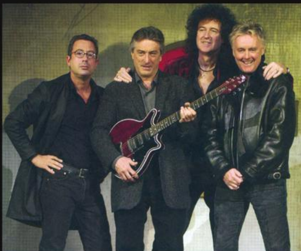
BEN ELTON, ROBERT DE NIRO, BRIAN MAY AND ROGER TAYLOR LONDON, 2002