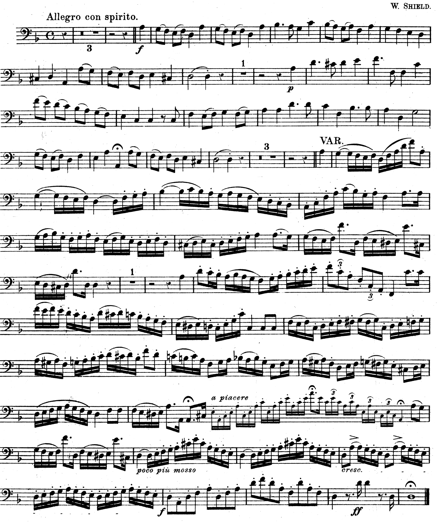
Euph. & Piano 1/6 net.