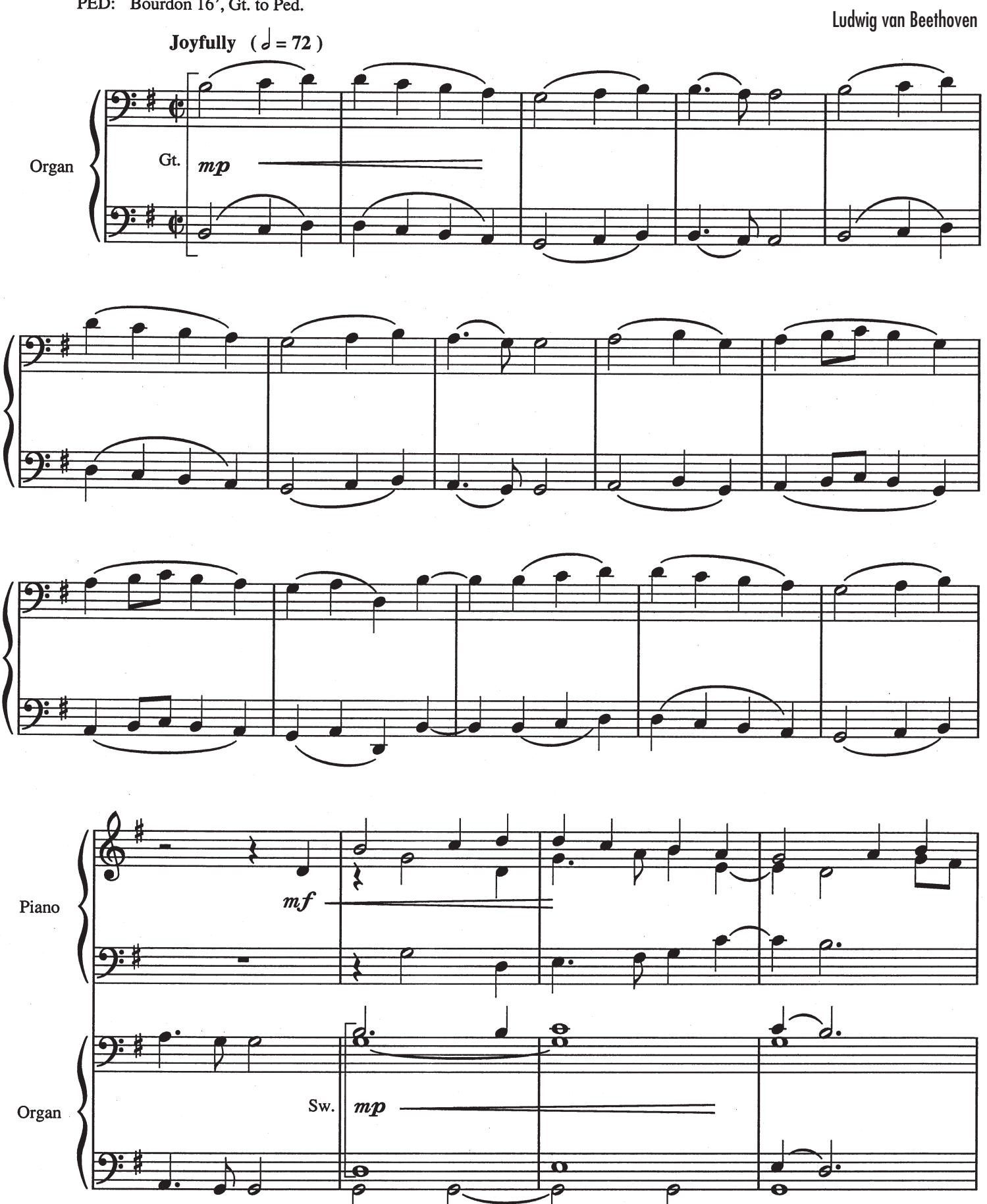
© 1991 BELWIN-MILLS PUBLISHING CORP., a Division of ALFRED MUSIC PUBLISHING CO., INC. All Rights Reserved including Public Performance

SW: Flutes 8', 4' GT: Diapason 8', 4' PED: Bourdon 16', Gt. to Ped.