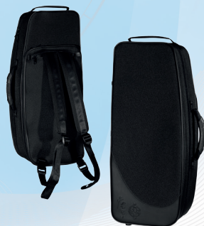
A case specially designed for the Axos saxophone, with backpack straps.

Henri SELMER Paris ambassadors recommend Axos