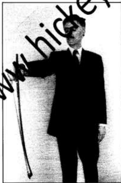
Fig. 9 — Preparing the German bow hold.