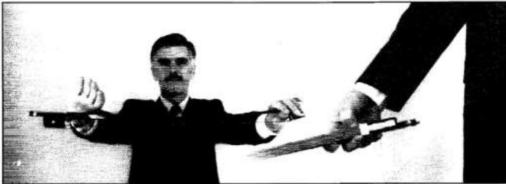
Figs. 7&8 — Preparing the French bow hold. A piece of latex tubing on the stick creates a cushion for the thumb which must be bent.